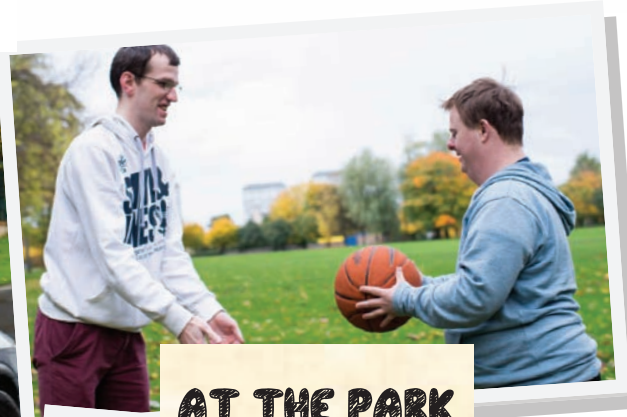
AT THE PARK