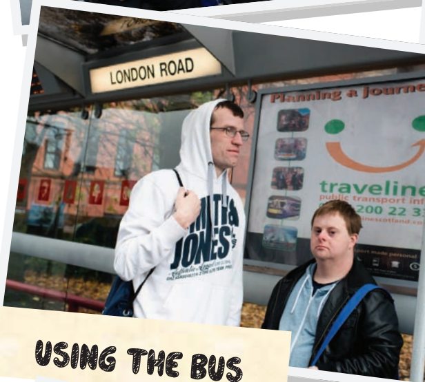
USING THE BUS