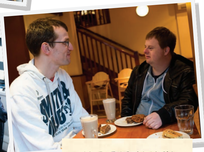
OUT FOR LUNCH